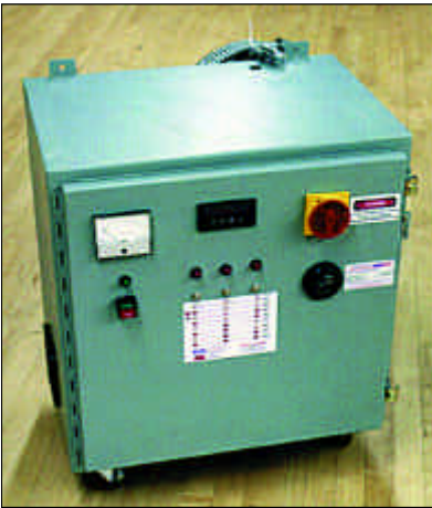
Con-Trol-Cure's Premium Encased Power Supply