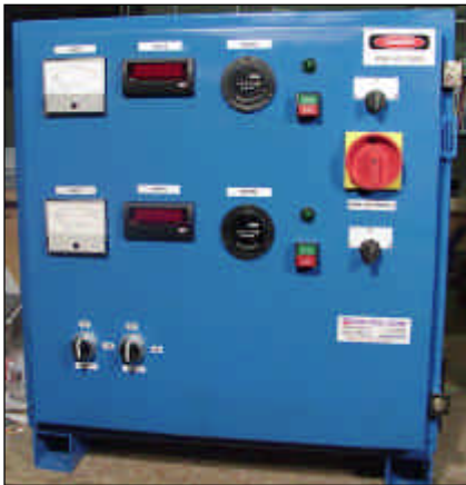
Con-Trol-Cure's Basic Dual Encased Power Supply

Con-Trol-Cure's Encased Power Supplies include a variety of unique performance features custom designed to match your specific UV lamp specifications.