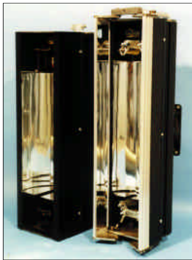
Lighthouse 3/4 Elliptical Shuttered and Non-shuttered UV Lamp Housings