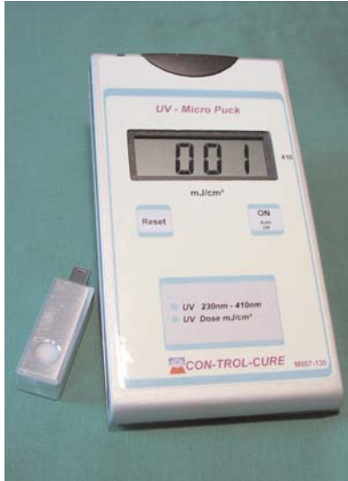
Micro Puck Radiometer