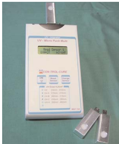
Micro Puck Multi

The CON-TROL-CURE MICRO PUCK™ is a unique instrument that enables UV measurement in extremely difficult to access environments. Compact UV sensors make it possible to measure UV Dose even in most confined UV curing units. The MICRO PUCK system consists of two parts: a hand-held base unit with a display and a UV sensor. Simply plug the sensor into the base unit to view the measured results. The MICRO PUCK is available in four different measuring ranges: