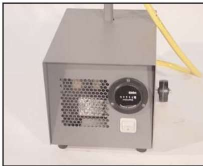
The compact power supply is mounted on wheels for easy maneuvering