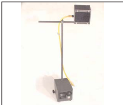
The Scarab™ 400 UV-A Shop Lamp stem with optional, adjustable stand